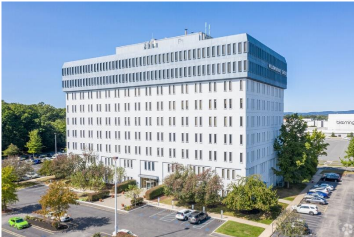
View of Christine Valmy International School of Esthetics & Cosmetology front of the building from the street: