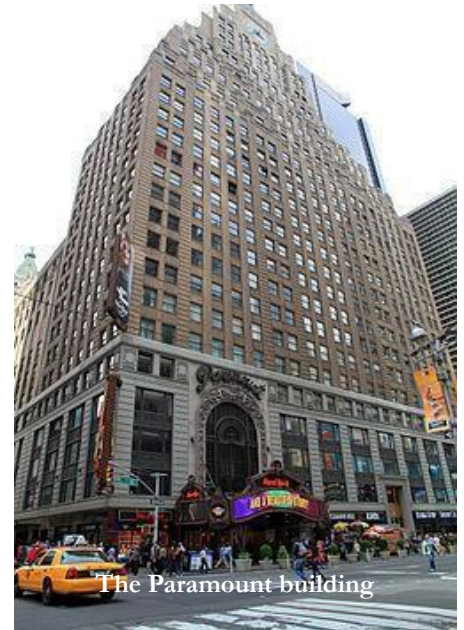
The Paramount building

Located in Times Square, at the "Crossroad of the World", Christine Valmy school is at the center of all subway lines and within walking distance from Port Authority bus terminal and Path stations.